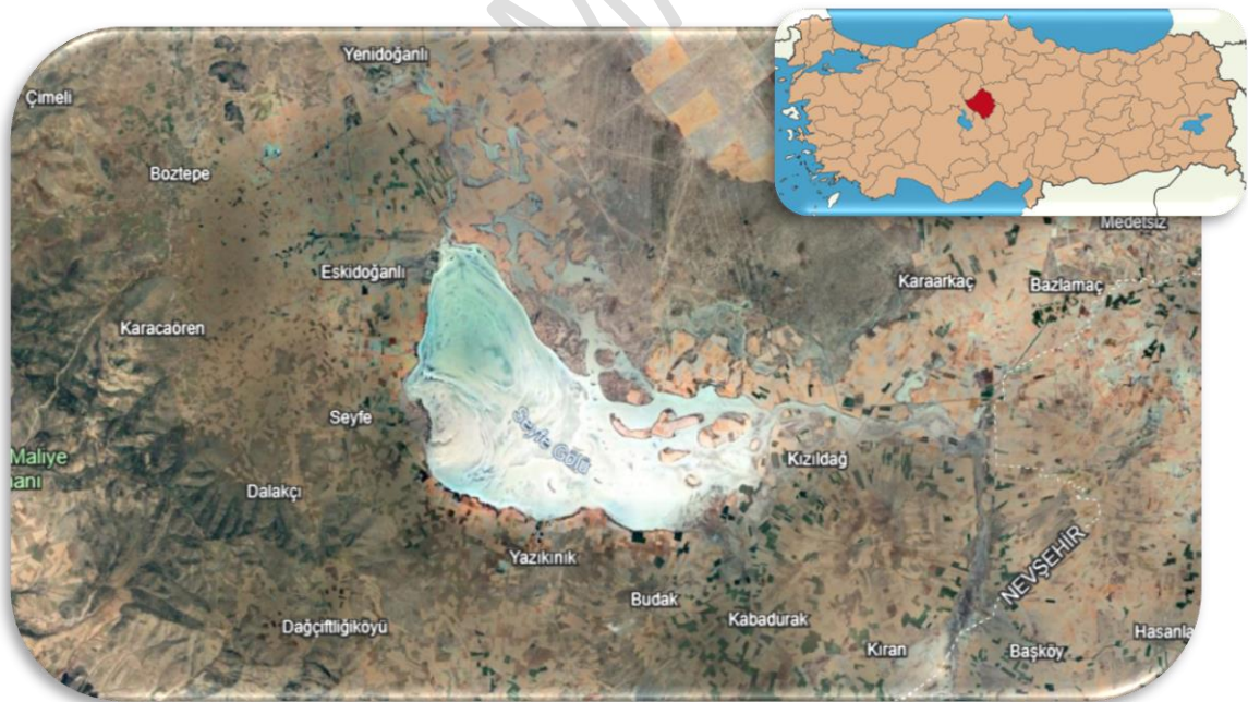
Figure 1. Seyfe Lake and Seyfe Wetland map in Kırşehir-Türkiye

The main material of the study consisted of primary data obtained from face-to-face questionnaire completion, showing the levels of agricultural activities and environmental attitudes of producers in the agricultural sector around Seyfe Lake. The research was conducted in 6 villages (Kızıldağyeniyan, Gümüşkümbet, Yazıkınık, Seyfe, Eskidoğanlı, and Budak) bordering the Seyfe Lake Irrigated Area of the Mucur district of the Kırşehir province (Figure 1).