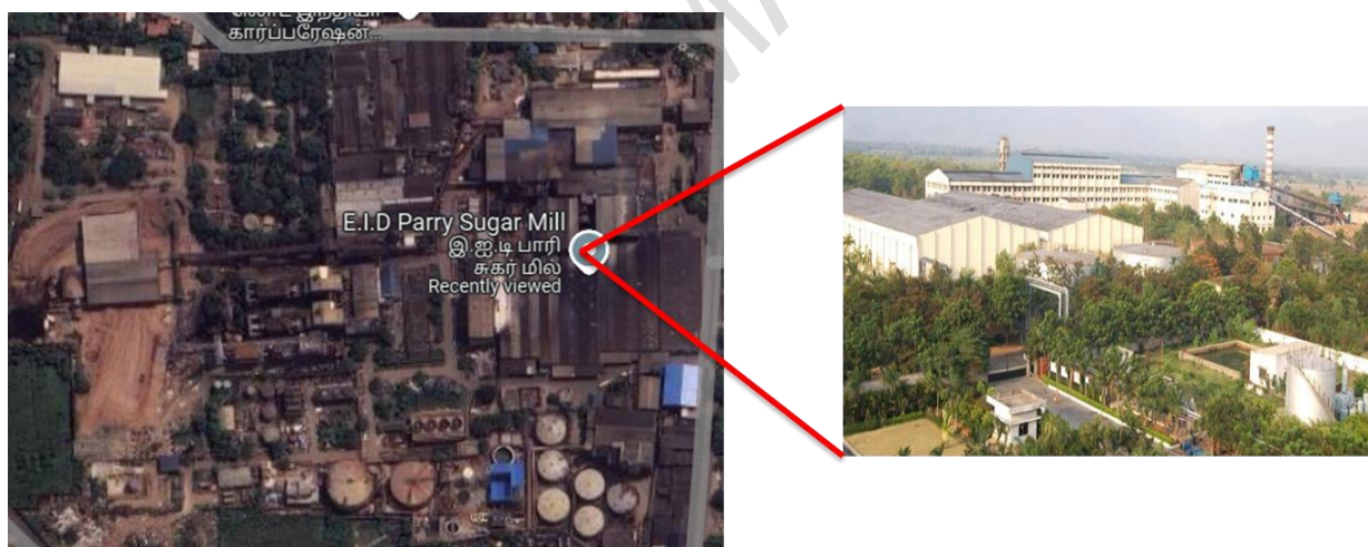
Figure1. Map of the EID Parry (India) Limited Nellikuppam, Tamil Nadu

Nellikuppam, Tamil Nadu was the study venue, consisting of the sugarcane processing at EID Parry (India) Limited is shown in figure 1. EID Parry is one of the oldest leading companies in India which is fully involved in the manufacture of sugar and cultivation along with the processing of sugarcane.