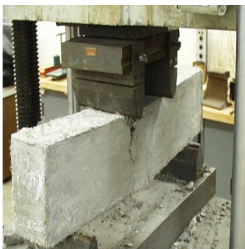
Figure 5. Flexural strength test