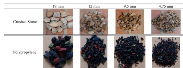
Figure 2. Coarse aggregate: (a) crushed stone aggregate (SA), (b) polypropylene (PP) aggregate