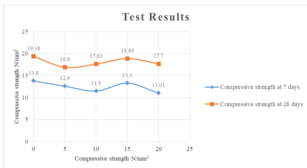
Figure 4. Strength results of Compression test