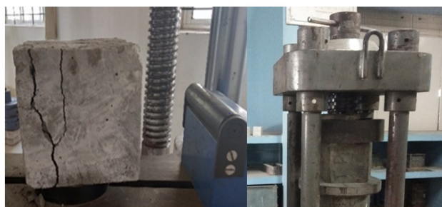
Figure 3. Compressive strength test

(UTM) in accordance with ASTM C 293-16 (Vivek et al. , 2017; Jose et al. , 2022). For the compression machine, the loaded level is maintained constant at 0.25 0.05 MPa/s, whereas displacement rate in beam test was kept constant at 0.15 mm/min. The stress-strain measurements were gathered with the aid of a computerized compress meter to compute elastic modulus according to ASTM C469-14 (Bhanu et al. , 2022). The values were gathered for test procedure in this investigation (Figure 6). The primary method of flexural testing involves a 28-day test. Curing in a specimen evaluates the amount of pressure needed to bend a plastic beam and establishes a material's stiffness or resistance to flexing. The material's ability to bend before permanently deforming is indicated by its flex modulus.