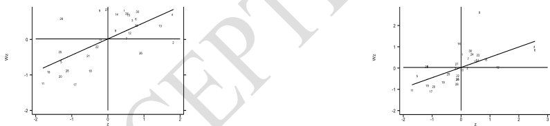
Figure 1. Scatter diagram of local Moran's I index in 2004 (left) and 2017 (right)

The global autocorrelation index can test the whole correlation, the spatial correlation of local farmland surface pollution in China cannot be observed from it. In this essay, local Moran'I index is adopted to evaluate the spatial correlation between neighboring regions. Moran'I index is used to plot Moran scatter diagram of farmland surface pollution of provinces and cities in China in 2004 and 2017, as shown in figure 1 . In 2004, provinces and cities in the first quadrant include Anhui, Fujian, Chongqing, Gansu, Guangdong, Guangxi, Guizhou, Henan, Hubei, Hunan, Jiangsu, Jiangxi, Shandong, Shanghai and Zhejiang, forming the “high-high” cluster region; provinces and cities in the second quadrant include Hainan, Tianjin, Yunnan, forming the “low-high” cluster region; provinces and cities in the third quadrant include Hebei, Heilongjian, Jilin, Liaoning, Inner Mongolia, Ningxia, Qinghai, Shaanxi, Shanxi and Xinjiang, forming the “low-low” cluster region; provinces and cities in the fourth quadrant include Beijing and Sichuan, forming the “high-low” cluster region. Therefore, it could be seen that the farmland surface pollution had great spatial differences between the regions in 2004 and had obvious positive correlation and clustering features.