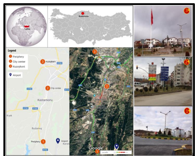
Figure 1. Location map of the study area and photographs of sampling points.