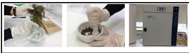
Figure 2. Images of sample preparation

The concentrations ( \mu\text{g/g} ) of Cu, Pb, Ni and Zn in the samples were analyzed by using Inductively Coupled Plasma-Optical Emission Spectrometry (ICP-OES) with an Spectro Blue/Spectro. The samples were firstly homogenized sterilely by milling in a mill (Isolab). It was then dehydrated using the Microwave Burning System (Nüve FN 120 Dry Heat sterilizer/Ovens Milestone) (Figure 2).