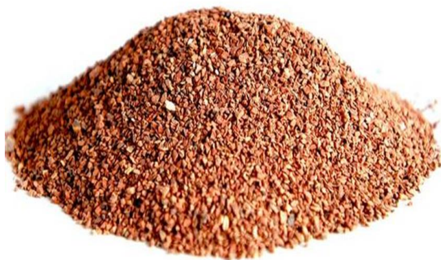
Figure 2. Mixture of sand with nanoparticles of Fe 2 O 3