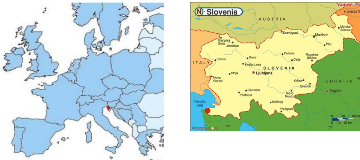
Figure 1. Map and position of Secovlje Salina

Traditional coastal salt production is one of the rare economic activities with a minor impact on the natural environment, with favourable influence on the conservation of the biodiversity and landscape. The daily manual collecting of the salt, produced from the marine saturated brine with the help of the solar energy in the pans that have the bottom covered with a layer of the biosediment - 'petola', is a method centuries old. This way of collecting salt is still used in the salinas of Secovlje and Strunjan (together known as Piranske soline), that were just slightly renewed in the year 1904, when the Istra Region was administered by the Austro-Hungarian monarchy.